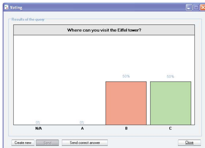
SANAKO Study Voting Module allows teachers to see at a glance how many students have understood the lesson by instantly displaying the voting results.