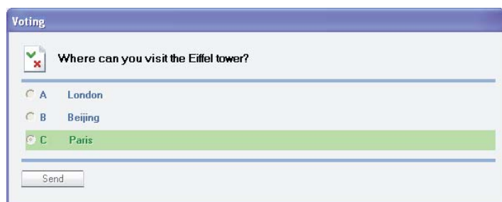
SANAKO Study Voting Module allows teachers to pose multiple choice questions to instantly test student engagement in the lesson.

Teachers using the module can launch a question to students. The teacher can then immediately correct any misunderstandings on the subject matter based on student responses, ensuring more effective learning.