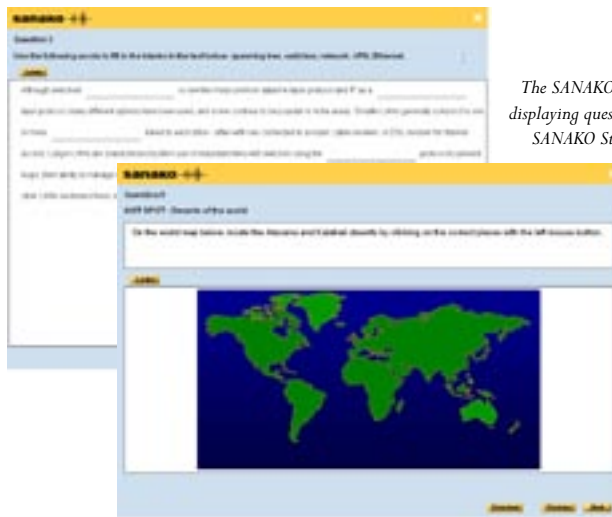
The SANAKO Study Exam Player displaying questions created with the SANAKO Study Exam Wizard.